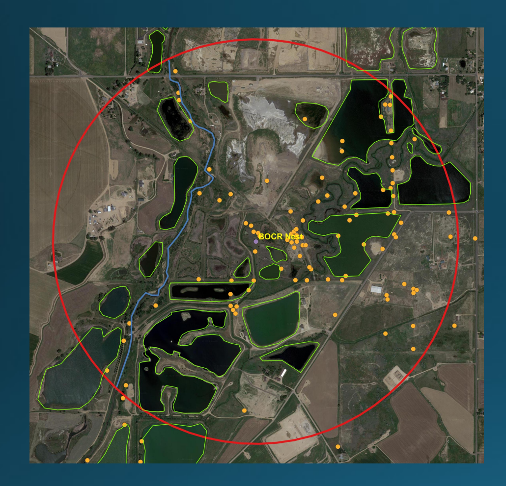
Female Territorial Bald Eagle—Territorial Presence Dawn to Dusk 26 days—75% Presence (350 hours)